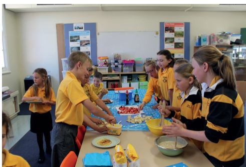
PBL Pancake reward day.