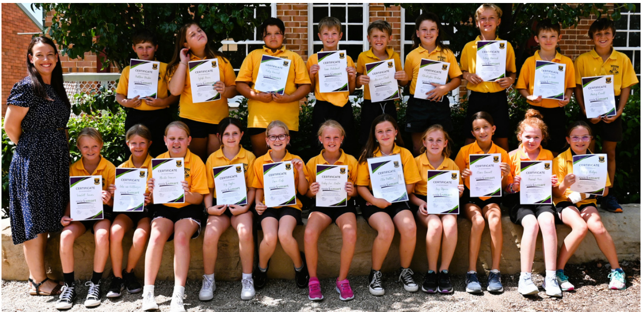
QuickSmart Numeracy Graduates